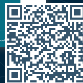
Guidelines on Joint Investigation Teams involving Third Countries