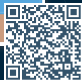
Guidelines for Civil Society Organisations