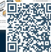
Factsheet on the Core International Crimes Evidence Database (CICED)