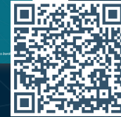
Guidelines on Joint Investigation Teams involving Third Countries