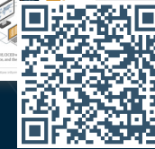
Factsheet on the Core International Crimes Evidence Database (CICED)