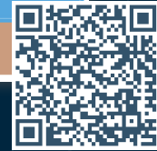
Guidelines for Civil Society Organisations