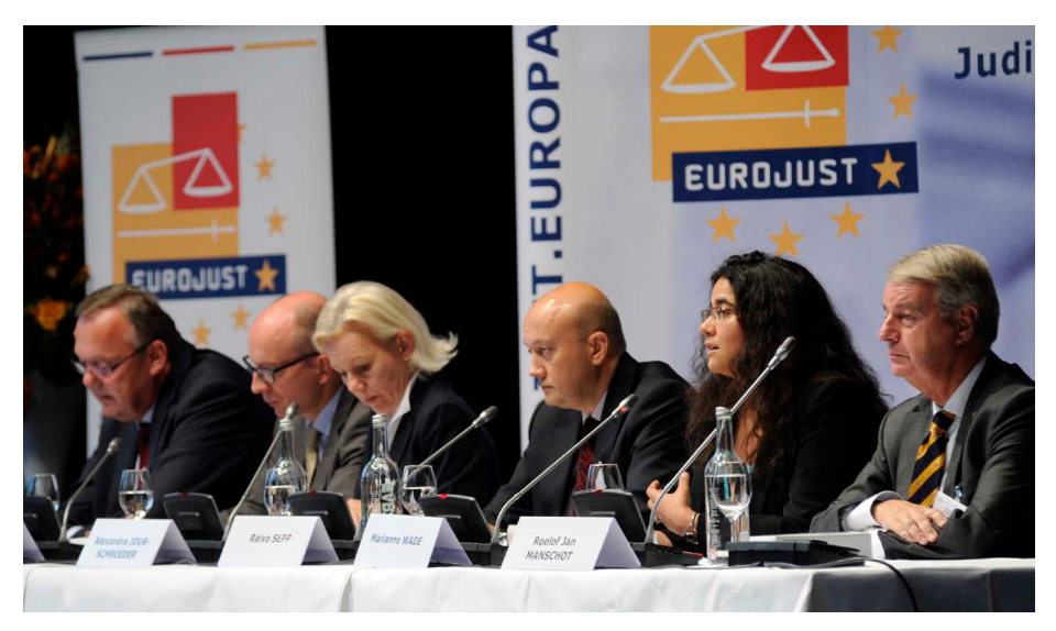
Eurojust-ERA conference in The Hague, November 2012

to a player with binding operational powers at vertical integration level". An increase in Eurojust's powers would entail an increase in its responsibilities and accountability to the European Parliament and national parliaments.