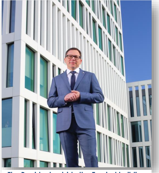
The President outside the Eurojust building

cross-border nature. As I mentioned earlier, this requires the ability to respect diversity and maintain an open mind. More in general, you have to be prepared for the high pressure that comes with this job. You will face long hours, conflicting interests and disappointment when you realise that justice does not always prevail in the way you thought it would. At the end of the day, what matters most is being able to look in the mirror, knowing that you kept your back straight and did the right thing.