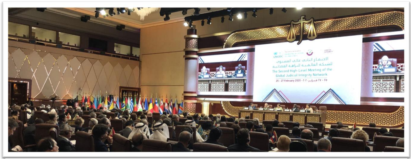
The GJIN meeting in progress in Doha

The Second High Level Meeting of the Global Judicial Integrity Network in Doha, State of Qatar "Past, Present, Future"