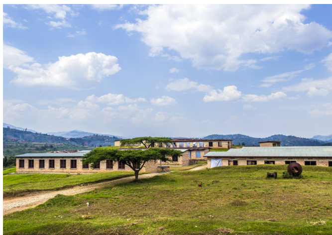
Site of mass graves in Butare, Rwanda, one of several memorials to the victims of the 1994 genocide in which an estimated 800,000 people were murdered.

Combined with inflows of refugees to the Member State, the recent escalation of nearby conflicts in Syria and Northern Iraq, as well as more distant locations such as Rwanda, Sierra Leone and the Democratic Republic of Congo, has brought these crimes increasingly within the scope of Europe’s judiciary. These recent or ongoing crimes may directly implicate EU nationals, such as those committed by foreign terrorist fighters (FTFs). Alternatively, citizens of Member States may be involved in investigations as witnesses of the committed offences, or even as victims.