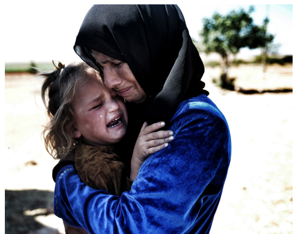
Civilians caught up in the terror waged by ISIL.

Dutch national receives additional sentences for war crimes - In July 2019, a Dutch national was prosecuted as an ISIL (Da'esh) terrorist fighter after returning to the Netherlands from Syria. Further to his conviction for membership of a terrorism organisation, the man was found guilty of the war crime of inhumane treatment of dead persons, which increased his sentence. Using a Facebook photo of the accused posing next to a deceased man hanging on a cross, prosecutors were able to bring charges of degrading and humiliating treatment of dead bodies. The man was sentenced to seven-and-a-half years in prison (five years for his membership of ISIL (Da'esh), and two-and-a-half for the war crime).