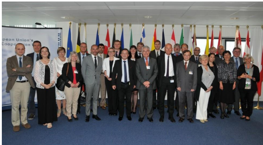
Plenary meeting in June 2014

In accordance with Article 27(1) of the Data Protection Rules 7 , the Data Protection Officer presented the 8 th Annual Data Protection Survey to the JSB in December. Five national desks and one administrative unit of Eurojust had participated in the survey. In her findings, the Data Protection Officer highlighted in particular that there was an increased awareness and application of Article 19 of the Data Protection Rules, which had been one of the recommendations of the 2013 JSB inspection report. The JSB will use the findings of this report as a basis for its inspection in January 2015.